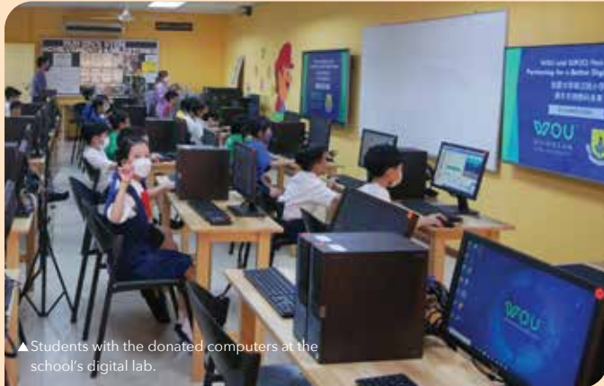
▲ Students with the donated computers at the school's digital lab.

The generous contribution by WOU to a primary school in Penang has provided greater opportunity for students to enhance and apply their Science, Technology, Engineering and Mathematics (STEM) knowledge in a diverse range of applications.