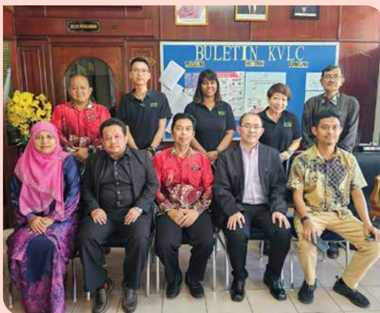
▲ WOU academia and staff from the Ipoh Regional Centre visit Kolej Vokasional Lebuh Cator in Perak.