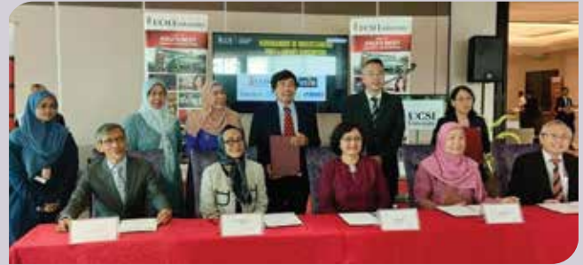
▲WOU proud to be part of the PHEIL Consortium.

In response to escalating database subscription costs, an alliance of seven prominent private institutions of higher learning has established the Private Higher Education Institution Libraries (PHEIL) Consortium to enhance library and information services through increased cooperation, resource sharing and the implementation of cost-effective strategies.