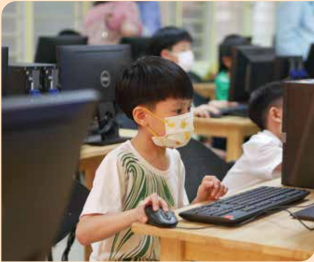
▲ Developing skills with patience.

She then emphasised WOU's unwavering commitment to supporting capacity building initiatives for the school's STEM educators.