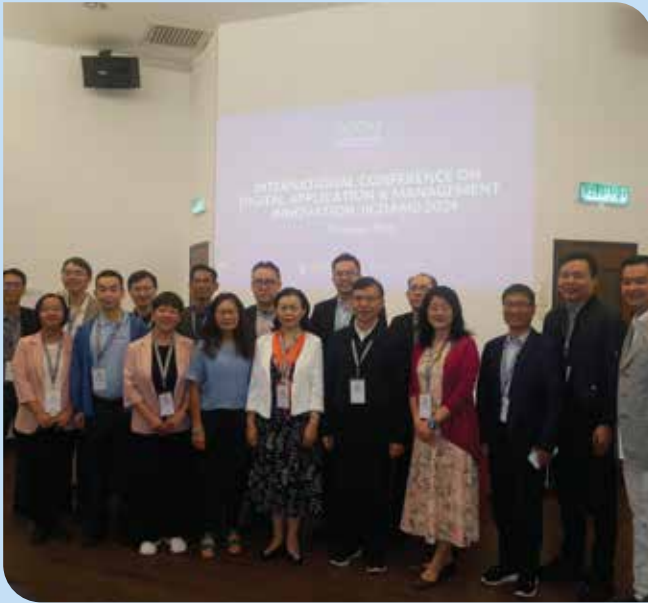
▲ WOU academia with ICDAMI participants.

The 1st International Conference on Digital Application and Innovation Management (ICDAMI) 2024 successfully left an indelible mark in the global research and academia landscape, addressing pertinent issues related to digital technologies, the economy and management innovation in the 21st century.