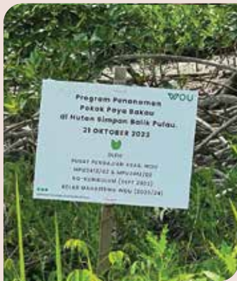
▲ The mangrove saplings grow beautifully.

It's a cause for celebration! In October last year, in honour of National Environment Day, WOU and SM Teknik Tunku Abdul Rahman Putra (STAR Putra) students joined forces for a fantastic project by planting a whopping 400 mangrove saplings along the scenic riverbank of Malindo Beach in Balik Pulau. We're proud to announce that our mangrove saplings have grown beautifully after a few months.