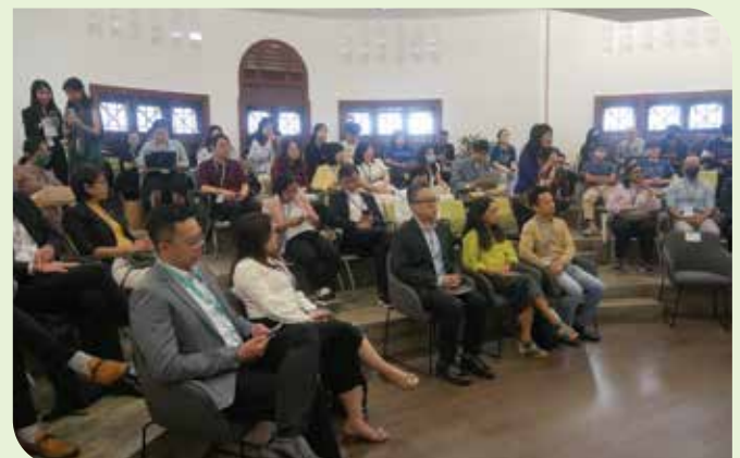
▲ Some of the education experts at the symposium.

By harnessing the collective expertise of academia, industry as well as government stakeholders, we can nurture a culture of innovation and drive socioeconomic progress.