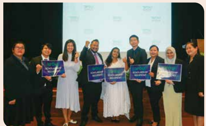
▲ Happy, deserving recipients.

He added, "Today's event is more than just the awarding of scholarships; it signifies our joint dedication to breaking down barriers, empowering individuals, and envisioning a future where talent thrives irrespective of economic constraints."