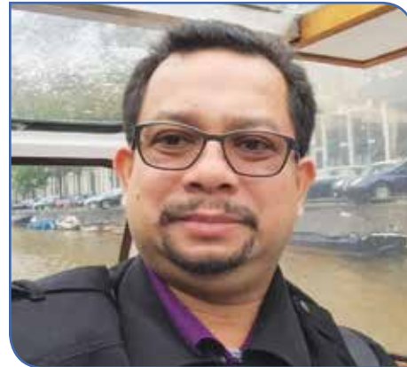
◀ Dr Khairur wants SMEs to take concrete steps towards IR 4.0.

Industry4WRD policy is a national policy to transform the manufacturing sector and related services within the period from 2018 to 2025. Under Industry4WRD, the government