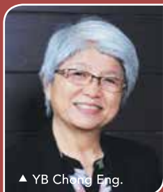
▲ YB Chong Eng.

There is a serious need to strengthen access to psychological first aid (PFA) for survivors of domestic violence to make them feel safe, calm and hopeful, and also connect them to helpful information and services.