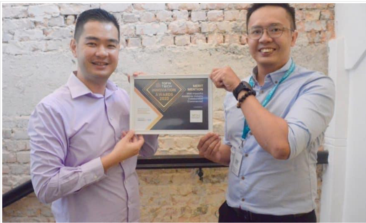
( https://www.buletinmutiara.com/wp-content/uploads/2023/02/IMG-20230117-WA0005.jpg )

February 1, 2023 ( https://www.buletinmutiara.com/wou-digit-school-in-penang-offers-students-work-experience/ )